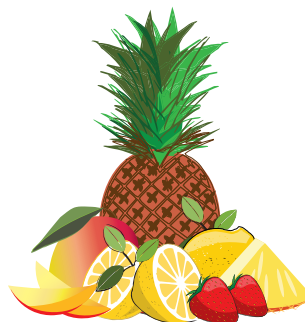
Fruit illustration by Tasty Az team member Sam Flowers

TRAVEL AND DELIVERY FEES APPLY. ADDITIONAL ITEMS AND HOSPITALITY SERVICES AVAILABLE ON REQUEST WE CAN SUPPLY DISPOSABLE PLATES, NAPKINS/CUPS, GLASSES & CULTRY AT A COST OF $2.50 PER PERSON DELIVERY FEES ARE APPLICABLE TO TRAVEL OUTSIDE OF MOUNT EVELYN